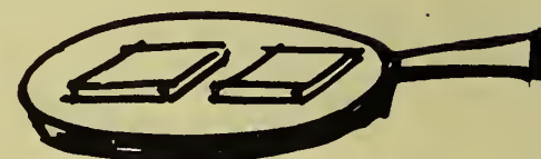
brown on both sides